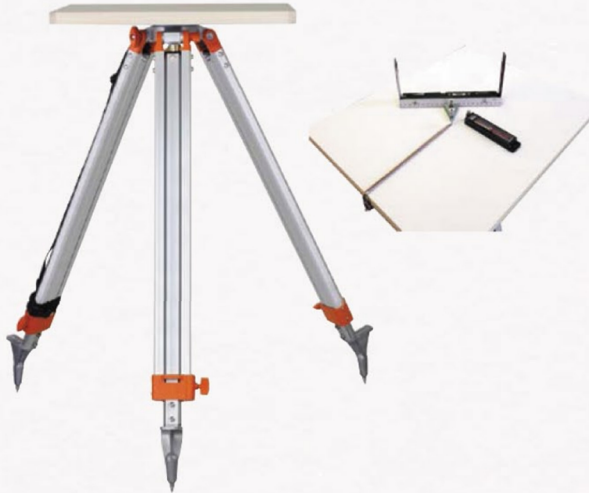
► PLANE TABLE SET (Plane table & tripod with moving head)

Everybody can make a map easily with these equipments.