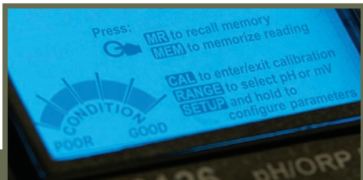
HI 9126 Graphic Backlit Display

When the batteries are low, you don't have to worry about carrying a spare set with you—the batteries can be recharged with HANNA's inductive recharger. Simply leave the meter on the recharger for a few hours and you're ready to go. The recharger can be plugged into a standard 115V or 230V socket using the appropriate HANNA adapter.