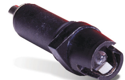
HI 73127 — pH Electrode