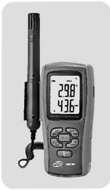
Manual version: GM1361-EN-01