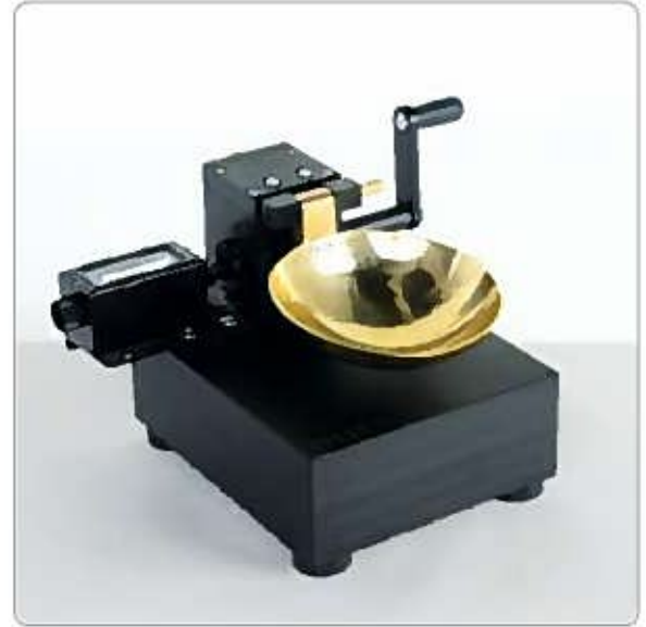
UTS-0200B with UTS-0216

The grooving tools which differ according to the preferred test standard should be ordered separately.